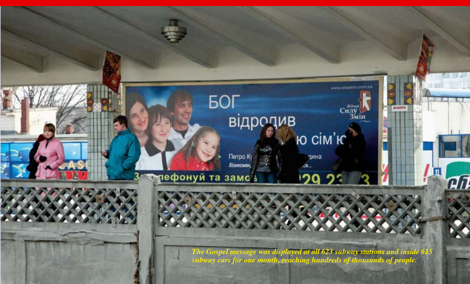
The Gospel message was displayed at all 623 subway stations and inside 615 subway cars for one month, reaching hundreds of thousands of people.

Embassy speaks out against purposeful disinformation.